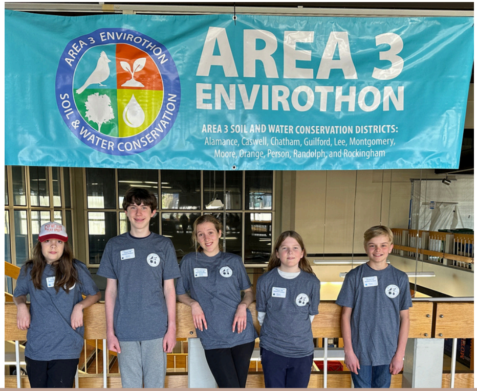
2024 Area 3 Envirothon Winners - Chapel Hill Homeschoolers