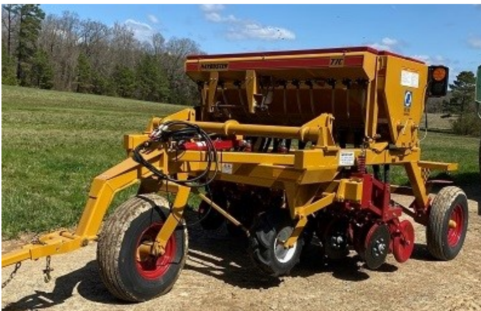
Haybuster 77C No-till Seed Drill