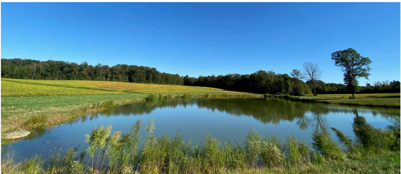
Completed Irrigation Pond