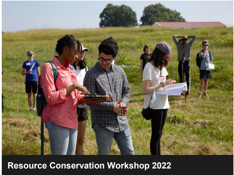
Resource Conservation Workshop 2022

The Resource Conservation Workshop is a weeklong workshop that involves study and hands-on participation in a wide range of conservation topics. Students are housed at NC State University campus dormitories under the guidance of live-in counselors. Awards and scholarships can be won and are presented to students under several programs.