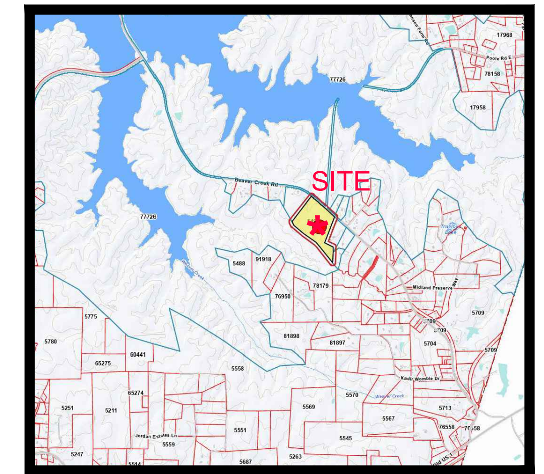
VICINITY MAP NTS