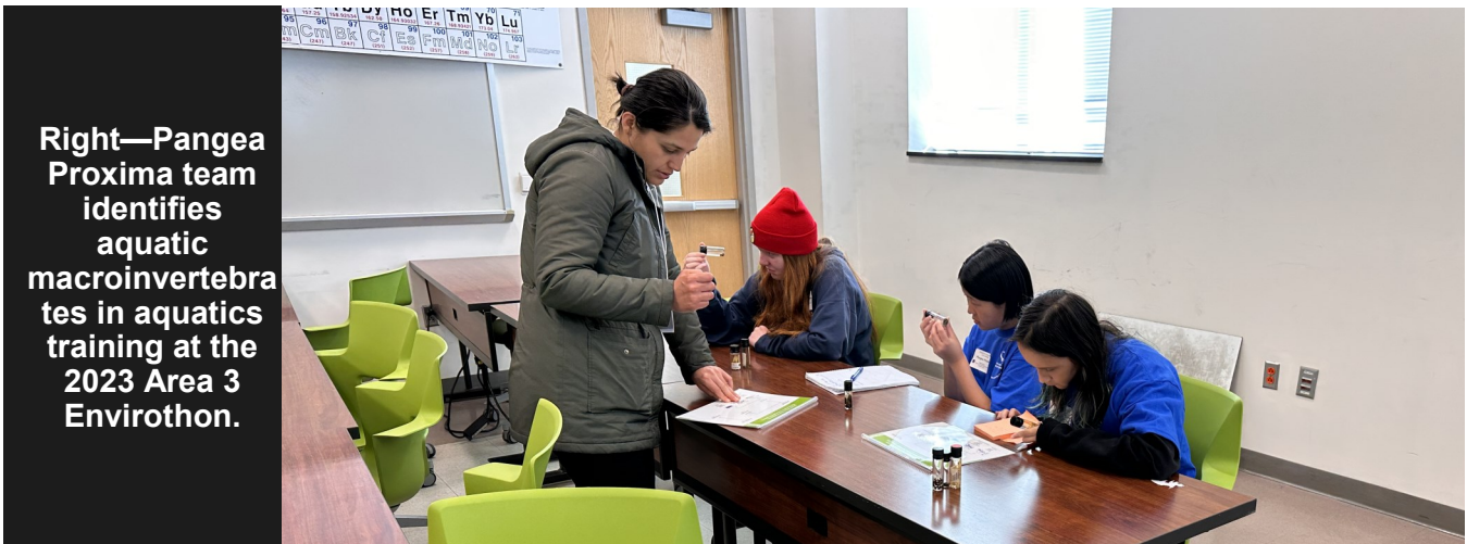
Right—Pangea Proxima team identifies aquatic macroinvertebrates in aquatics training at the 2023 Area 3 Envirothon.

The Envirothon program is an effective educational tool, capable of supplementing environmental education both inside and outside the classroom.