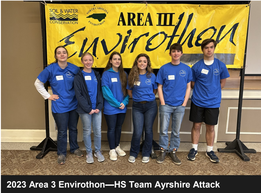
2023 Area 3 Envirothon—HS Team Ayrshire Attack

The Area 3 Envirothon was held on March 14th at Elon University. Chatham County had 4 teams participate this year. 1 high school team and 3 middle school teams. All middle school teams are eligible to advance to the NC Envirothon. Congratulations to all teams!