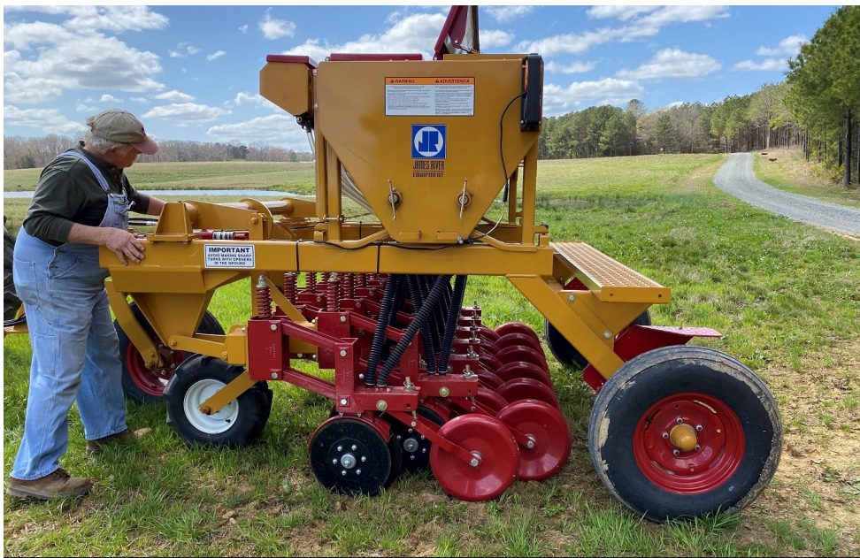
Haybuster 77C No-till Seed Drill

“Out of the long list of nature’s gifts to man, none is perhaps so utterly essential to human life as soil.”