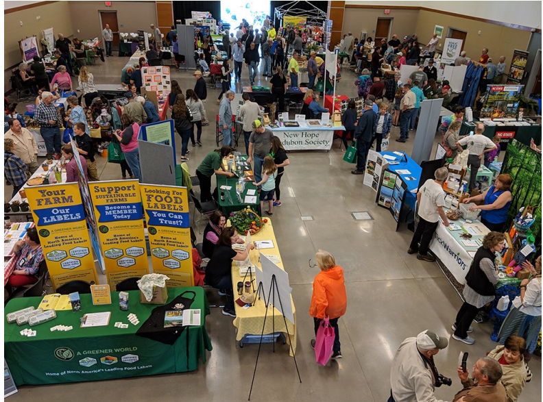
Over 75 indoor and outdoor exhibitors and vendors offer something for everyone!

Indoor and outdoor exhibitors and vendors will highlight local farms, farmers' markets, sustainable agriculture, agricultural support and advocacy, agribusiness, beekeeping, livestock, forestry, green industry, wildlife, conservation, and much more. We will have FREE pony rides for kids sponsored by the Chatham County Farm Bureau! Visitors will get to meet Smokey Bear and chat with our local forest rangers.