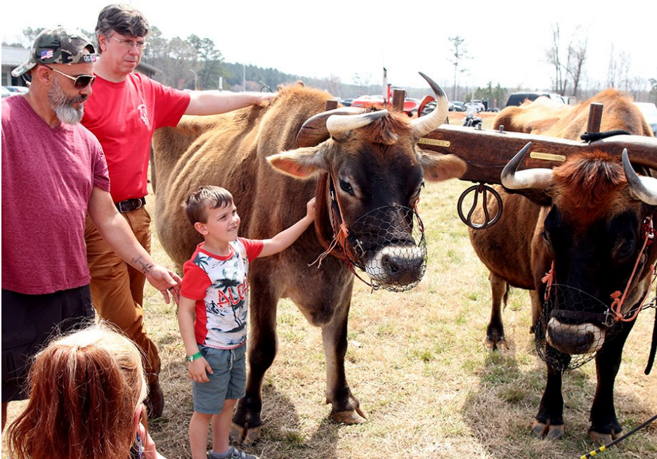
Folks of all ages enjoyed meeting the oxen team!

Several food trucks will offer tasty options for lunch. The event is free and open to the public. We encourage visitors to bring canned goods for our local food banks, CORA and West Chatham Food Bank.