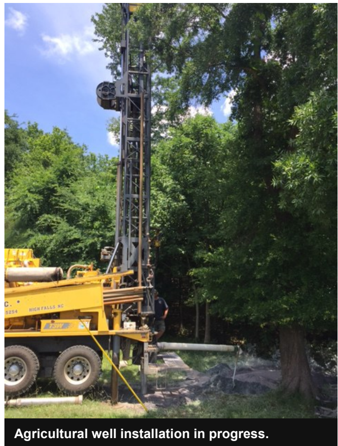
Agricultural well installation in progress.