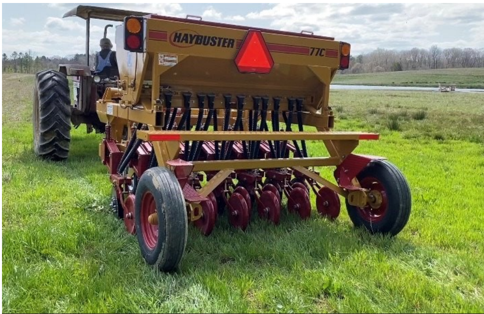
Haybuster 77C No-till Seed Drill

“Out of the long list of nature’s gifts to man, none is perhaps so utterly essential to human life as soil.”