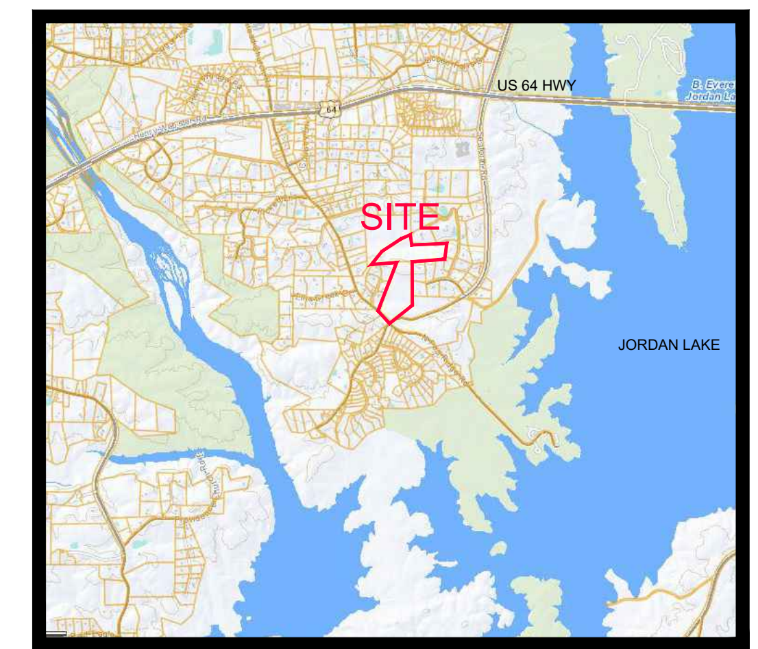
VICINITY MAP NTS