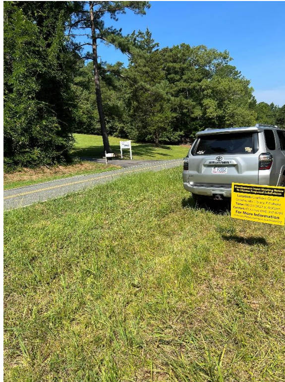
Announcement Sign on Seaforth Rd frontage