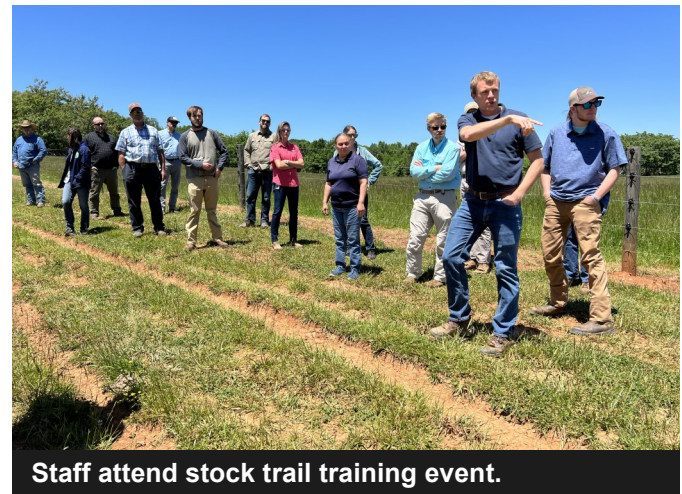
Staff attend stock trail training event.

During fiscal year 2022, Chatham Soil & Water provided programming to over 270 students and almost 30 teachers. Through the Division of Soil & Water Conservation, we helped provide training for almost 70 District and Division staff members from across North Carolina, most from the Piedmont area.