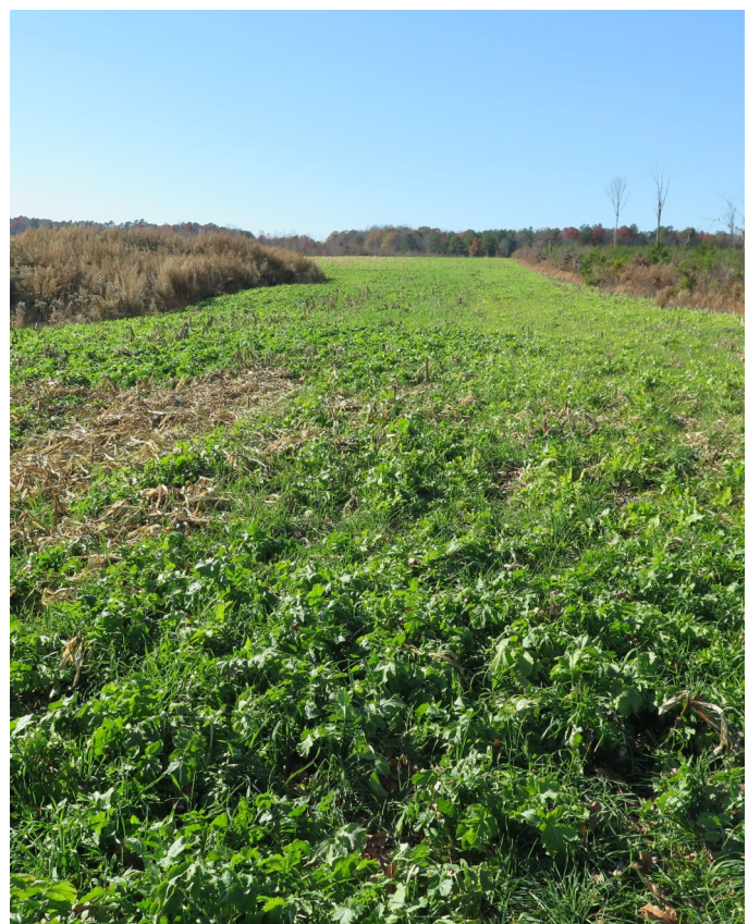
Cover Crop BMP Implemented in Chatham County by the Chatham Soil & Water Conservation District