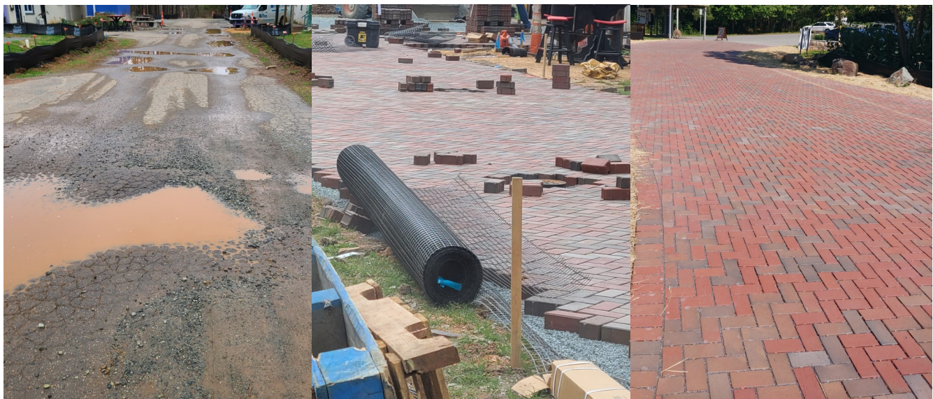
Permeable Pavement Project—Before (L), During (M), and After (R)