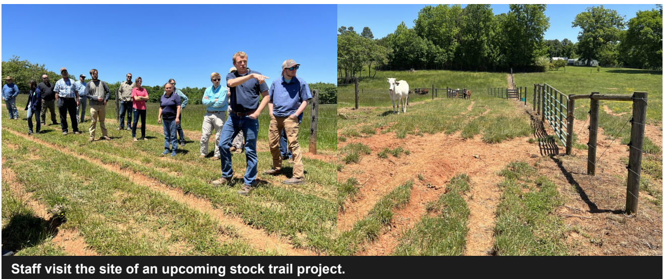
Staff visit the site of an upcoming stock trail project.

In the photo to the bottom right, you can see the erosion that has occurred due to the slope of the land in conjunction with cattle who use this path to move from pasture to pasture for rotational grazing. Installing a stock trail using proper grading and gravel will assist with slowing water and holding soil in place.