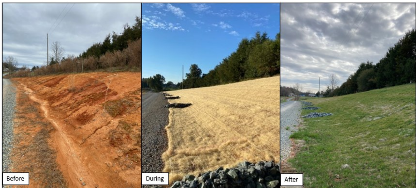
Recent critical area planting project funded through the ACSP—Before (L), During (M), and After (R)