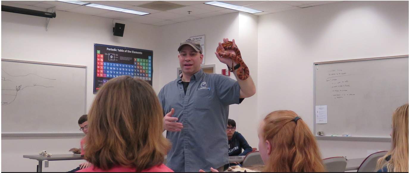
2019 Area 3 Envirothon