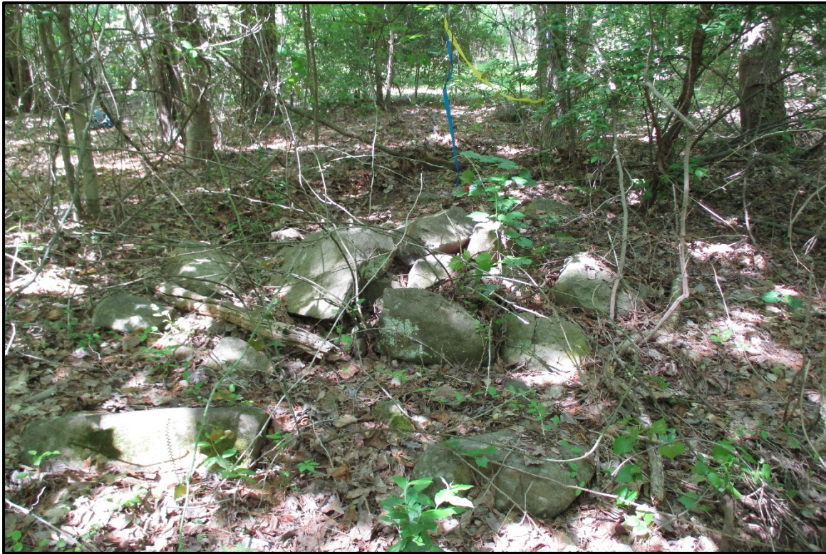
Figure 2. View of Rock Pile in VBG Location, Facing West.