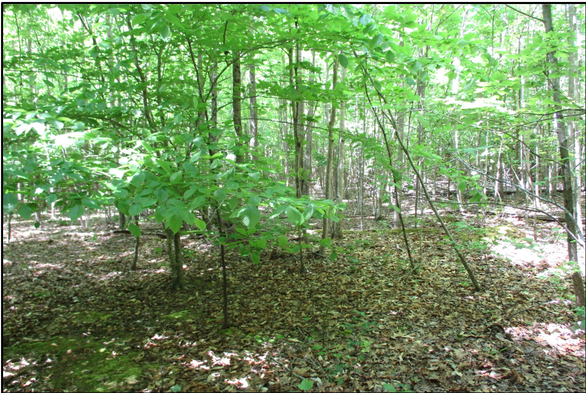
Figure 4. View of Cemetery Census Coordinate Location, Facing West.