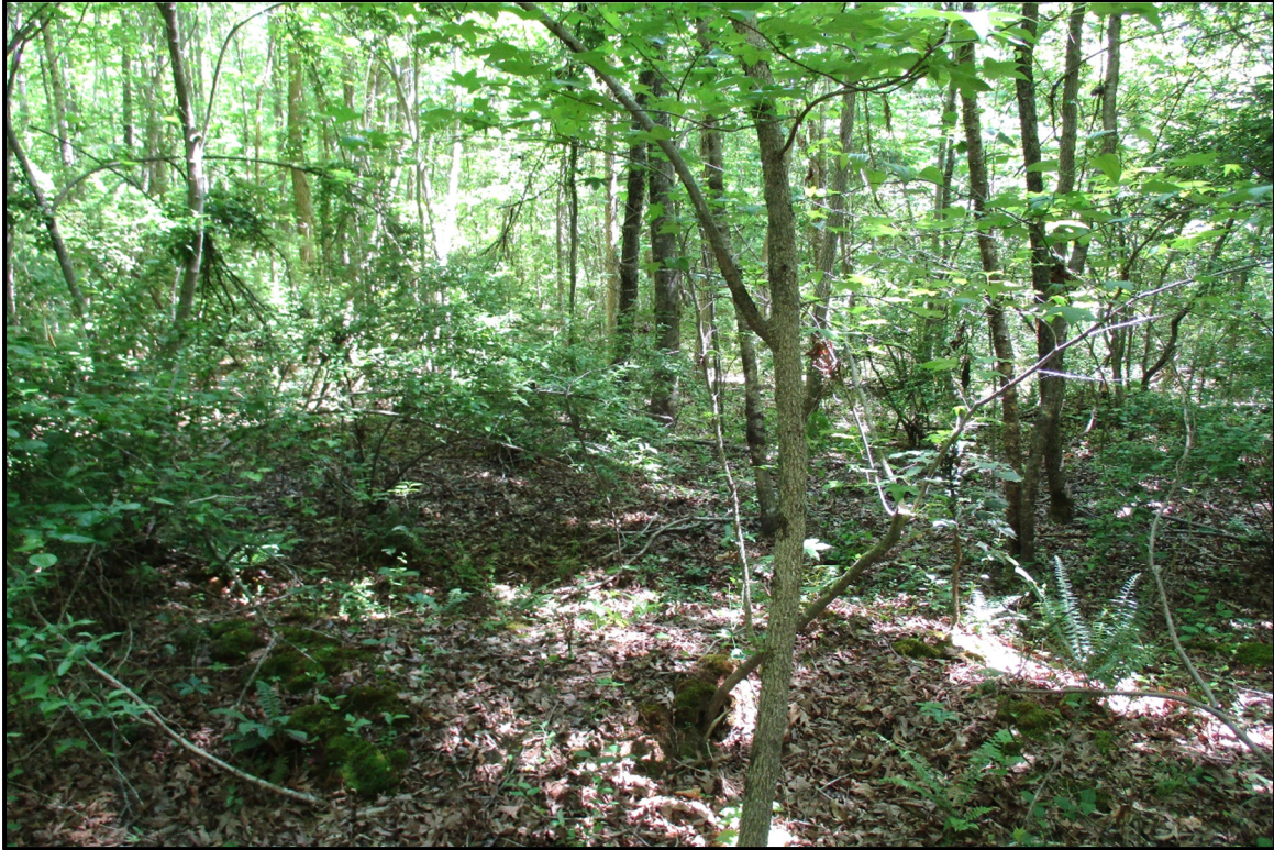
Figure 3. View of Chatham County Tax Map Location, Facing Northeast.