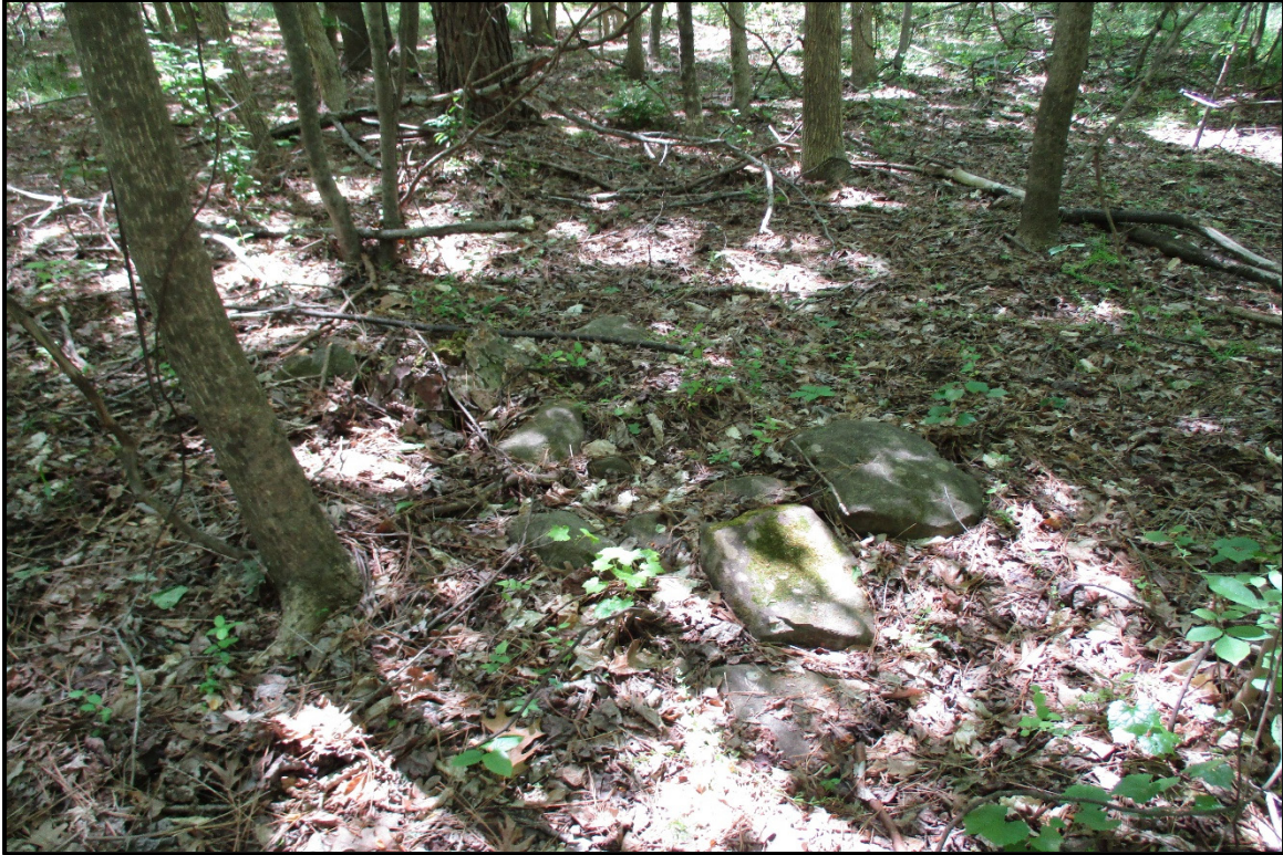
Figure 5. View of Additional Rock Pile, Facing Southwest.