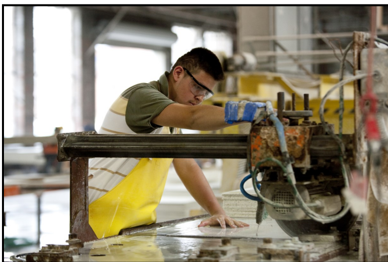
On the job at Floorazzo, Siler City