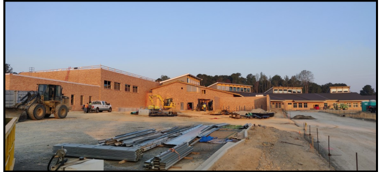
Chatham Grove Elementary School, Pittsboro