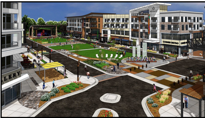
The MOSAIC is underway in Pittsboro. The development is expected to be the epicenter of Chatham Park.

Out of North Carolina's 100 counties, Chatham County is the 4th fastest-growing county at 2.7% behind Brunswick (4.6%), Johnston (3.2%), and Currituck (2.9%).