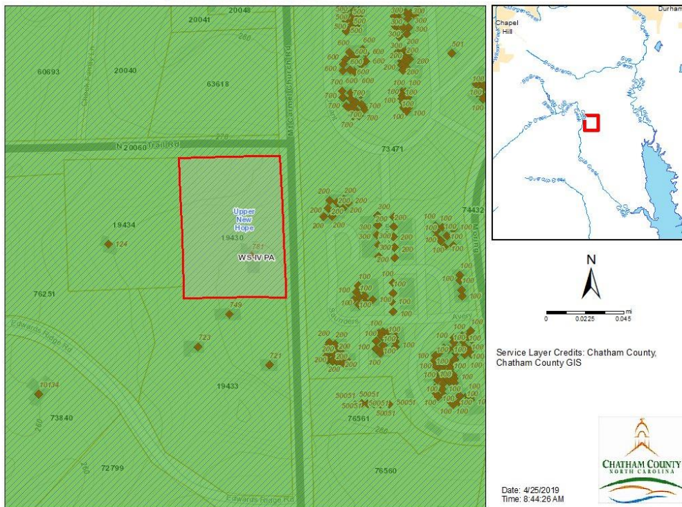
Chatham County Tax Map

The map above shows the Watershed District of WSIV-PA within the Jordan Lake Buffer rule area. Impervious surface is limited to 24% with curb and gutter and 36% without.