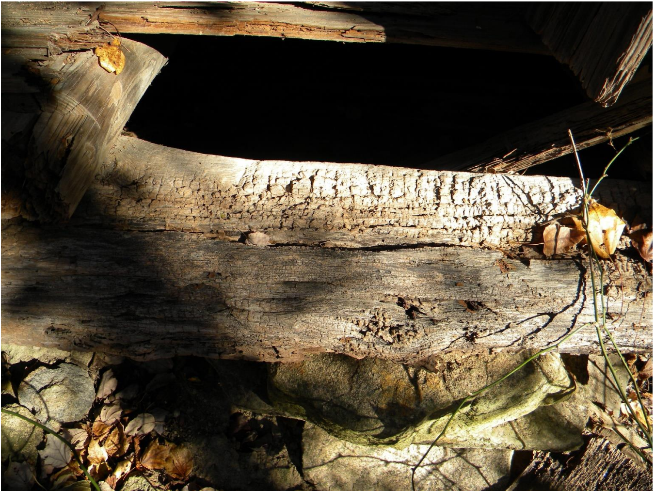
Deteriorated sill in shed addition section.