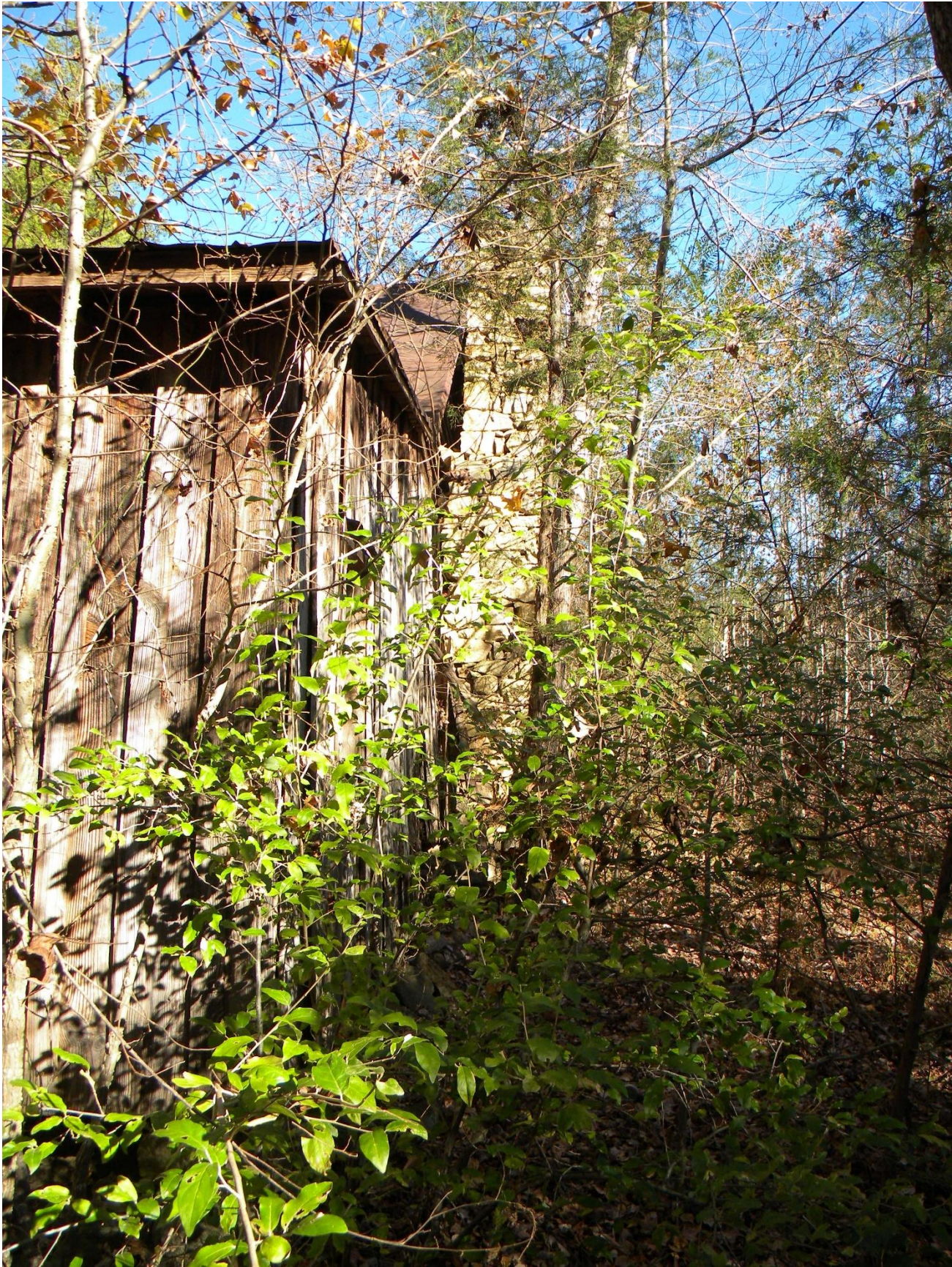
View of chimney from east end.