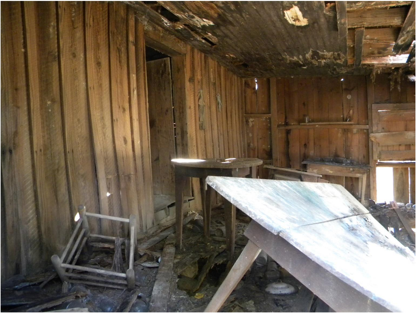
Interior of shed addition.