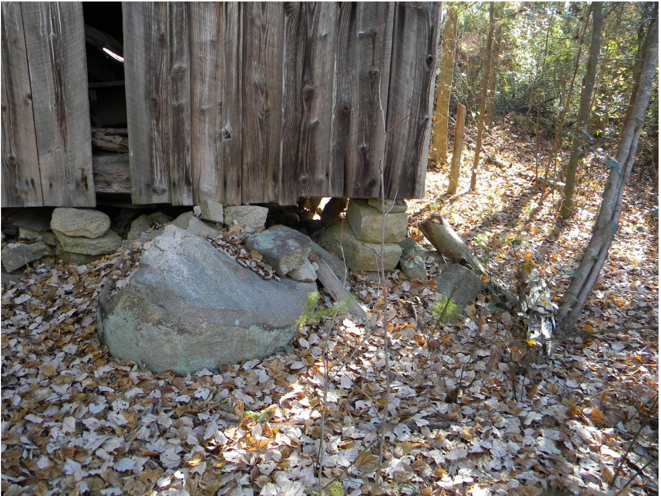
Shed addition. Looks like they built to accommodate the large boulder.