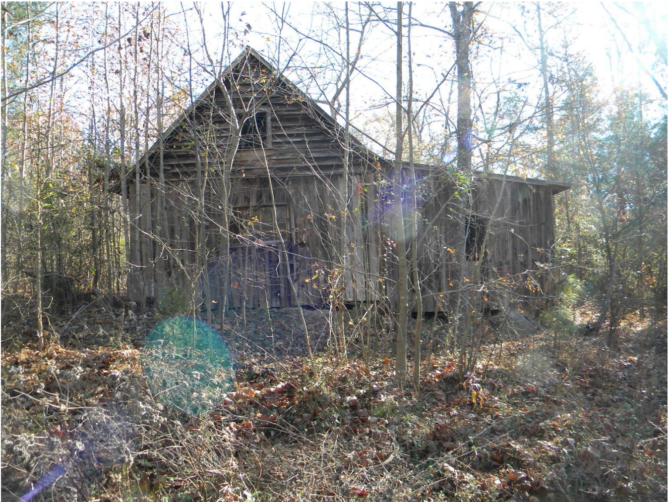
South-southeast side elevation.