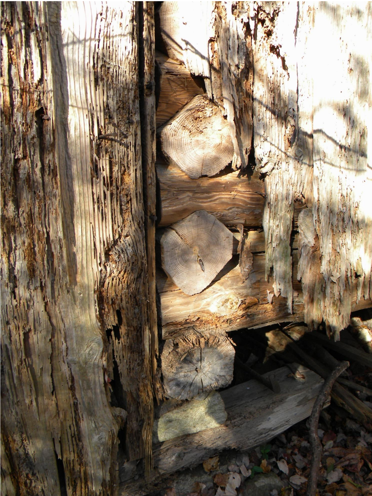
Exterior. Log corner where board and batten siding has deteriorated. This is to left of chimney.