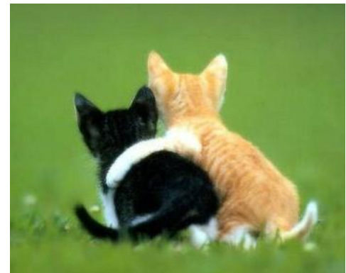
Being a Good Friend