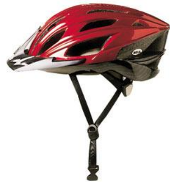
Wearing a Helmet